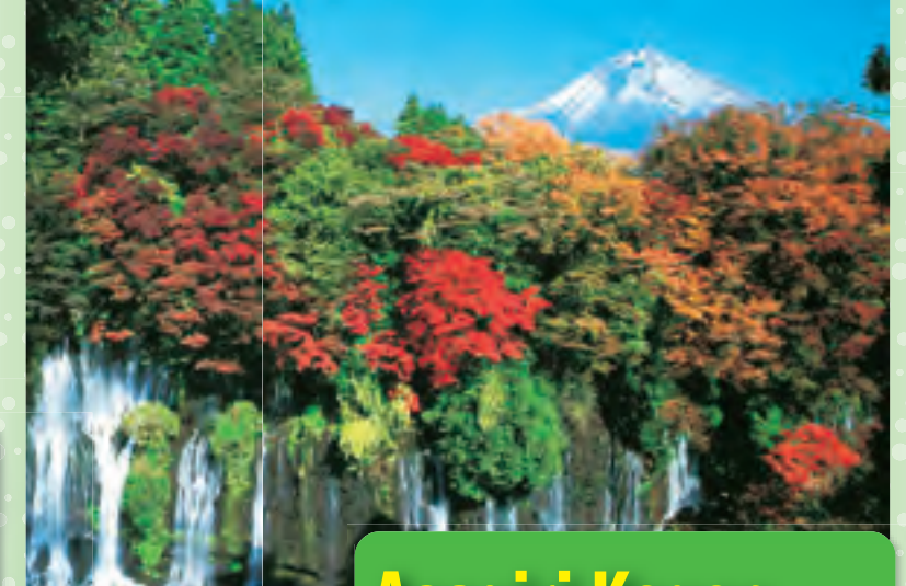
🌿 The natural treasure of Shiraito-no-taki Waterfall

Fujinomiya developed along the roads leading to Fujisan Hongu Sengen Taisha Shrine. Introducing the four distinct areas of the city!