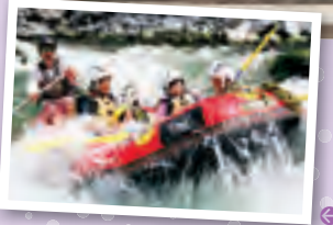
🚣 Rafting on the Fujikawa River

A famed temple set on expansive grounds. Legend has it that the head of Oda Nobunaga is buried beneath the roots of the hiiragi holly tree on the temple grounds. (MAP P14 A4)