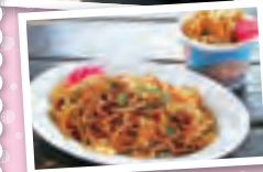
🍜 Fujinomiya yakisoba, a local specialty

A lively spot along the road leading to the shrine, with restaurants serving Fujinomiya yakisoba, gelato and other dishes. (➡P16)