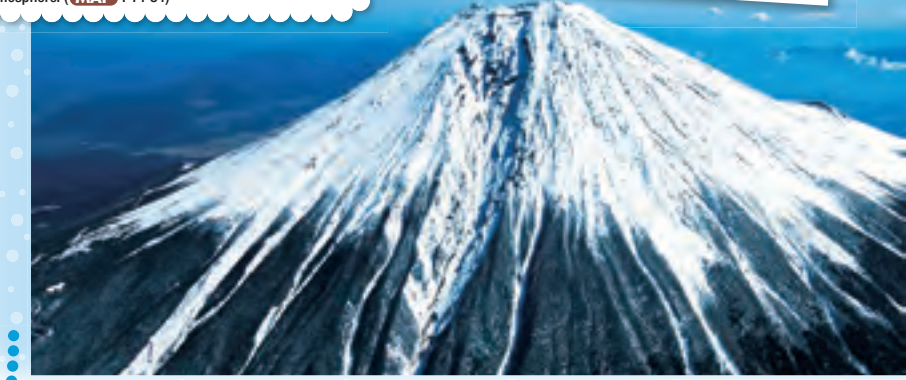
🌋 Mt. Fuji viewed from Asagiri Kogen in northern Fujinomiya City