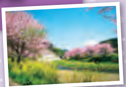
🌸 A line of sakura cherry trees that stretches roughly 2 km along the Inasegawa River (MAP P14 A5)

See traditional mountain village and terraced rice field landscapes, and sample the specialty products: bamboo shoots and Japanese apricots. Stroll around Nishiyama Honmon-ji Temple, and try rafting on the Fujikawa River.