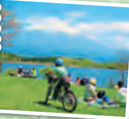
🌿 Many people enjoy picnics and camping at Lake Tanuki-ko

Michi-no-Eki Asagiri Kogen A roadside station well known for selling fresh vegetables. (MAP P14 B1)