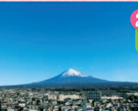
☎ One of the 20 Mt. Fuji viewpoints in Fujinomiya

☎ 150 Yumizawa-cho, Fujinomiya 10 minutes on foot from JR Fujinomiya Station No admission fee 8:30-17:15 ⓧ Saturdays, Sundays, national holidays, New Year holidays 312 spaces