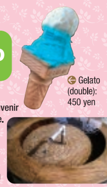
☎ Gelato (double): 450 yen

☎ Fuji Sugata, a Center-exclusive Mt. Fuji-shaped monaka (Japanese wafer): 1,000 yen for four pieces