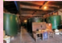
☎ Storage tanks lined up inside the long-standing warehouse

☎ 9-25 Takara-machi, Fujinomiya 16 minutes on foot from JR Fujinomiya Station 9:00-17:00 (Saturdays, Sundays and holidays: 10:00-17:30) ⓧ New Year 10 spaces