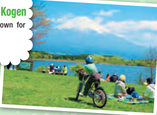
🌿 Many people enjoy picnics and camping at Lake Tanuki-ko