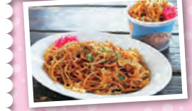
🍜 Fujinomiya yakisoba, a local specialty