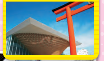
🏯 Fujisan Hongu Sengen Taisha Shrine, which is said to endow household harmony, safe births and other benefits

This hub for sharing information and conducting academic research on the World Heritage Mt. Fuji opened on December 23, 2017. (MAP P16)