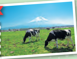
🌿 Try fresh milk and other foods in the Asagiri Kogen Area

A roadside station well known for selling fresh vegetables. (MAP P14 B1)