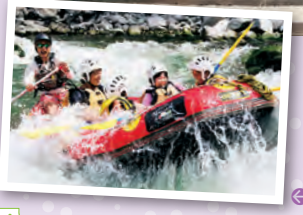
🚣 Rafting on the Fujikawa River

A famed temple set on expansive grounds. Legend has it that the head of Oda Nobunaga is buried beneath the roots of the hiragi holly tree on the temple grounds. (MAP P14 A4)