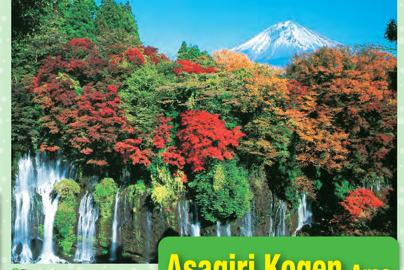
🌿 The natural treasure of Shiraito-no-taki Waterfall

Fujinomiya developed along the roads leading to Fujisan Hongu Sengen Taisha Shrine. Introducing the four distinct areas of the city!