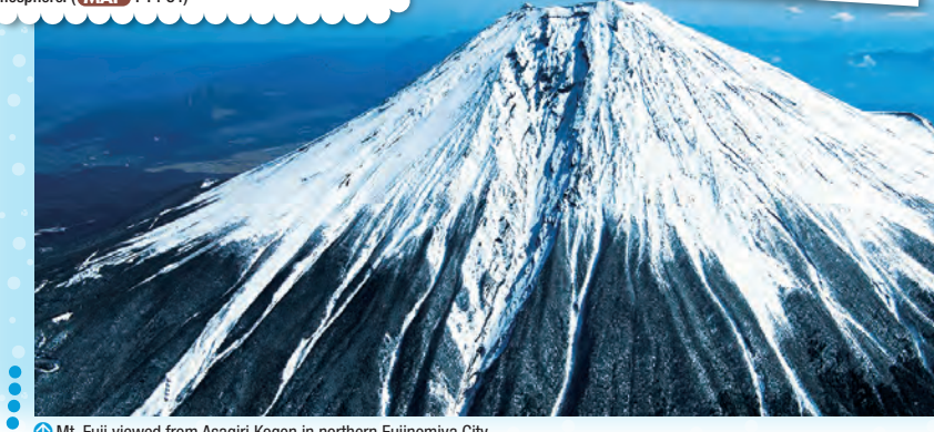
🌋 Mt. Fuji viewed from Asagiri Kogen in northern Fujinomiya City