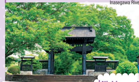
🏯 The main hall of Nishiyama Honmon-ji Temple. The kubizuka tomb of heads of Oda Nobunaga behind the main hall