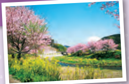
🌸 A line of sakura cherry trees that stretches roughly 2 km along the Inasegawa River (MAP P14 A5)

See traditional mountain village and terraced rice field landscapes, and sample the specialty products: bamboo shoots and Japanese apricots. Stroll around Nishiyama Honmon-ji Temple, and try rafting on the Fujikawa River.