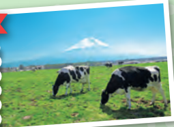
🐄 Try fresh milk and other foods in the Asagiri Kogen Area

Michi-no-Eki Asagiri Kogen A roadside station well known for selling fresh vegetables. (MAP P14 B1)