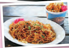
🍜 Fujinomiya yakisoba, a local specialty

A lively spot along the road leading to the shrine, with restaurants serving Fujinomiya yakisoba, gelato and other dishes. (MAP P16)