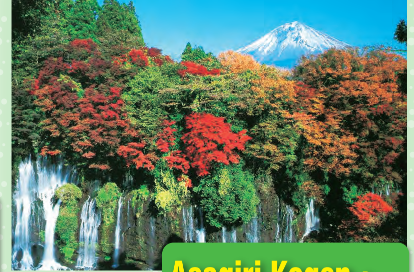
🌿 The natural treasure of Shiraito-no-taki Waterfall

Fujinomiya developed along the roads leading to Fujisan Hongu Sengen Taisha Shrine. Introducing the four distinct areas of the city!