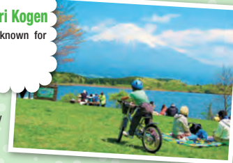
🌳 Many people enjoy picnics and camping at Lake Tanuki-ko