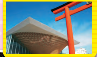
🏯 Fujisan Hongu Sengen Taisha Shrine, which is said to endow household harmony, safe births and other benefits

This hub for sharing information and conducting academic research on the World Heritage Mt. Fuji opened on December 23, 2017. (MAP P16)