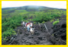
🏯 Yamamiya Sengen-jinja Shrine Vantage Point 🏯 The Murayama Sengen-jinja Shrine pavilion

At 2,400 m, the Fujinomiya Trailhead is the highest of the Mt. Fuji trailheads and offers the shortest route to the summit: roughly 5 km. The ascent requires 4-7 hours, and the descent requires 2-3 hours. (The climbing season on the Shizuoka side is July 10-September 10. For details, check the official website for Mt. Fuji climbing)