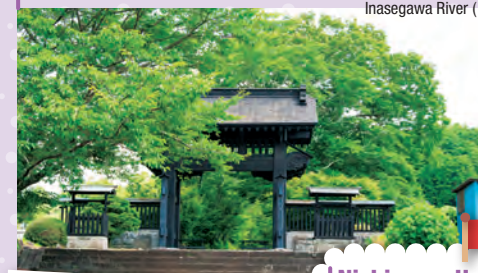
🏯 The main hall of Nishiyama Honmon-ji Temple. The kubizuka tomb of heads of Oda Nobunaga behind the main hall