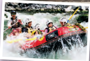
🚣 Rafting on the Fujikawa River

A famed temple set on expansive grounds. Legend has it that the head of Oda Nobunaga is buried beneath the roots of the hiiragi holly tree on the temple grounds. (MAP P14 A4)