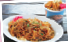
➡ Fujinomiya yakisoba, a local specialty