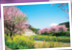
➡ A line of sakura cherry trees that stretches roughly 2 km along the Inasegawa River (MAP P18 A5)

See traditional mountain village and terraced rice field landscapes, and sample the specialty products: bamboo shoots and Japanese apricots. Stroll around Nishiyama Honmon-ji Temple, and try rafting on the Fujikawa River.