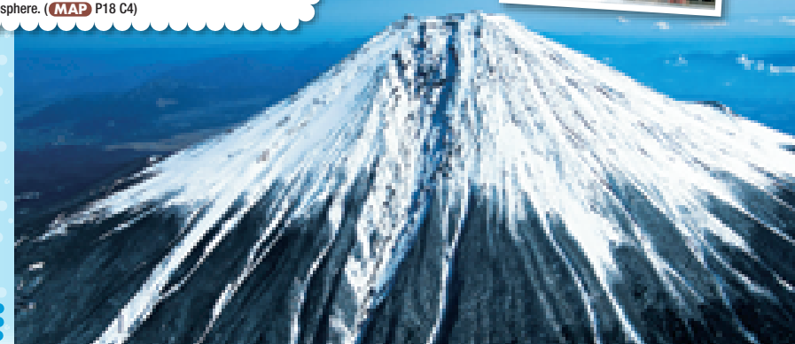
➡ Mt. Fuji viewed from Asagiri Kogen in northern Fujinomiya City