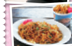
Fujinomiya yakisoba, a local specialty